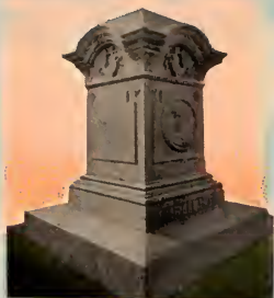
Edgar Allen Poe Monument.